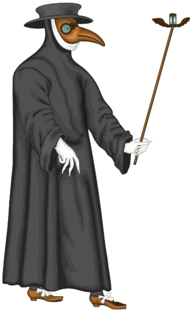
Fig. 4 Pest doctors in the seventeenth century wearing a protective outfit that included boots, a leather coat with long sleeves, hat, gloves, a rod, and a mask with an elongated beak filled with scented spices and perfumes so that they could approach and examine the extremely fetid patients. From: https://commons.wikimedia.org/wiki/File:Plague_Doctor.svg

of Asia. Despite the increasing news of virus dissemination, the dates of the Annual Meeting were maintained. Shortly after March 11, 2020, the EB decided to postpone all events for one year. It was also decided to maintain or “freeze” the EB members and officers, postponing all the elections to 2021. The five consecutive year rule for members to rotate off the EB was suspended and those who would normally be rotating off the EB continued.