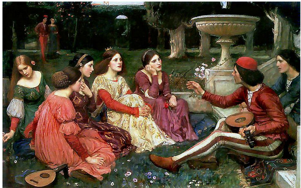
Fig. 3 A tale from the Decameron (J.W. Waterhouse, 1916) depicts a scene from Boccaccio's Decameron. The storytellers, seven girls and three boys, confined themselves to a castle near Florence to escape the Black Death.

of elective versus urgent intervention was deemed inadequate and pediatric neurosurgery priorities were defined in a case-to-case basis. Minimizing the risk of neurological deterioration and postponing surgeries indefinitely can have tragic consequences. Therefore, pediatric cases were risk-stratified to give a surgical response in the appropriate time. This concept is recommended to diseases, malignant or not, at risk of sudden deterioration [26]. These situations also applied to closed neural tube defects and craniosynostosis that cannot be postponed indefinitely and which delays may lead to the loss of the ideal treatment timing. Actually, there are very few pediatric neurosurgical pathologies that can be postponed for extended periods of time.