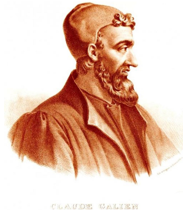
Fig. 2 Galenus of Bergama reported the Antonin Plague (166 AD), named after the roman emperor Marcus Aurelius Antoninus. It occurred when Rome enjoyed a period of prosperity and expansion with good conditions of hygiene and sanitation and was later on identified as smallpox.