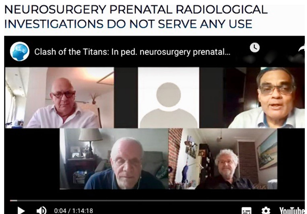
Fig. 6 Print screen of the first Clash of the Titans webinar "In Pediatric Neurosurgery Prenatal Radiological Investigations Do Not Serve Any Use," June 2020

detected, as well as the feeling that they would in part replace traditional meetings, discussion of cases, journal clubs, and other activities such as neuroanatomical training with 3D models [37, 38]. Consequently, one may