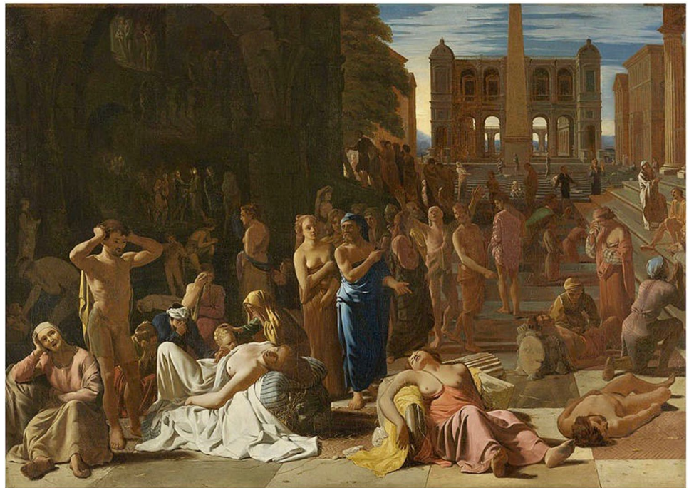
Fig. 1 Plague in an Ancient City (Michiel Sweeters, ca. 1654) depicts the plague of Athens, probably typhoid fever. Some experts believe that this epidemic took place in Rome in 361–363 AD under the rule of emperor Julian.

and also responsible for the outbreaks of Severe Acute Respiratory Syndrome (SARS) 2002 epidemic, the Middle East Respiratory Syndrome (MERS), and the COVID-19 pandemic [6].