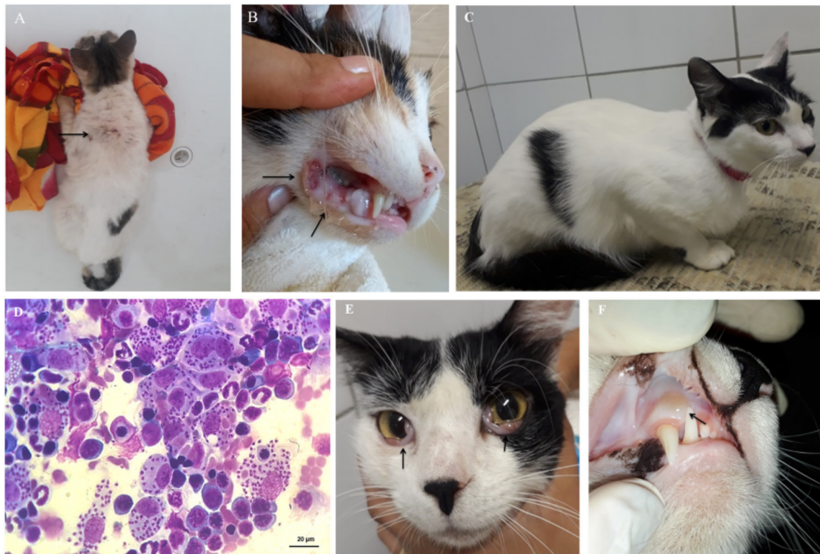
FIGURE 3 | Clinical signs of feline leishmaniasis. (A) Areas of alopecia in the dorsal cervical region (arrow), and (B) ulcers in the oral cavity, suggesting gingivitis-stomatitis complex (arrows). (C) First physical exam of a cat with active infection without clinical signs but presenting Leishmania detection in bone marrow aspirates by cytological examination (D) . After 4 months, this cat had (E) bilateral oedema and hyperaemia of the conjunctiva (arrows) and (F) aphthous stomatitis in the upper region of the right canine tooth (arrow).