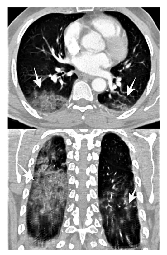
Figure 1 - Chest tomography scans obtained on the second day of hospitalization, showing ground glass opacities (white arrows) in both lungs, suggestive of alveolar hemorrhage.

remission of symptoms and normalization of laboratory parameters.