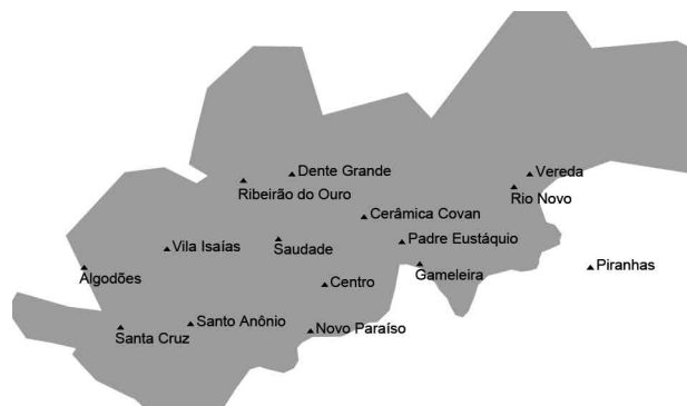
Fig. 2: distribution of the points of entomological capture (▲) in the districts of Janaúba, state of Minas Gerais, Brazil, April 2005-March 2007.

sion analysis using best subset regression. All tests were performed with 95% confidence.