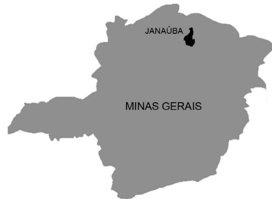
Fig. 1: geographical localization of Janaúba in the state of Minas Gerais, Brazil.

Statistical analysis - The distribution of monthly captured Lutzomyia longipalpis was tested for normality using the Kolmogorov-Smirnov test. The average mean and standard deviations (s.e.) were calculated using SigmaStat version 3.1.1 (Systat software Inc, USA). This software was additionally employed for multiple regres-