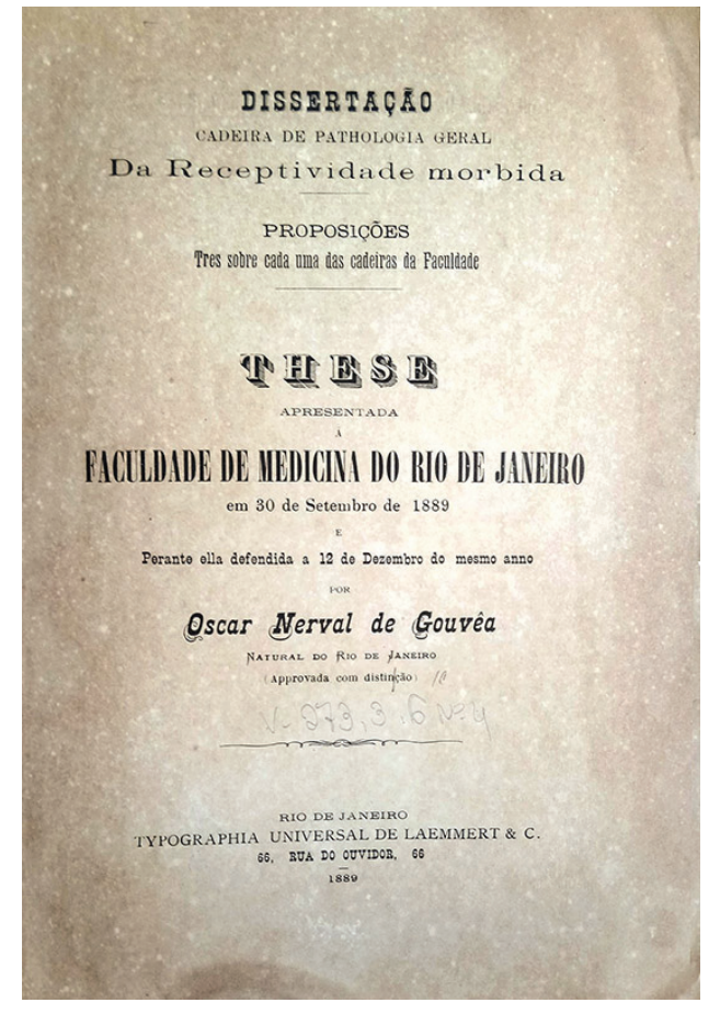
Figure 1: Front page of the monograph Da receptividade mórbida (Gouvêa, 1889; copy from the library of the Centro de Ciências da Saúde/Universidade Federal do Rio de Janeiro)

Gouvêa's involvement with both mineralogy classes and homeopathy could account for the insertion of his "Table of mineral classification" in a medical monograph.