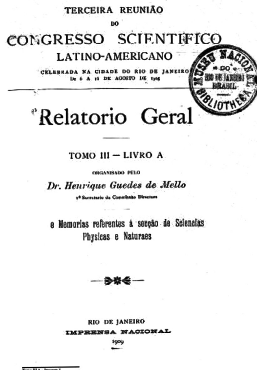
Figure 2 – Frontispiece of the General Report and Memoirs referring to the Physical and Natural Sciences section. Volume III. Book A. Published in Rio de Janeiro by the National Press, in 1909.

A botanist for much of his career until then, it is not just geological aspects that support Barbosa’s observations on the subject. As quoted by the author