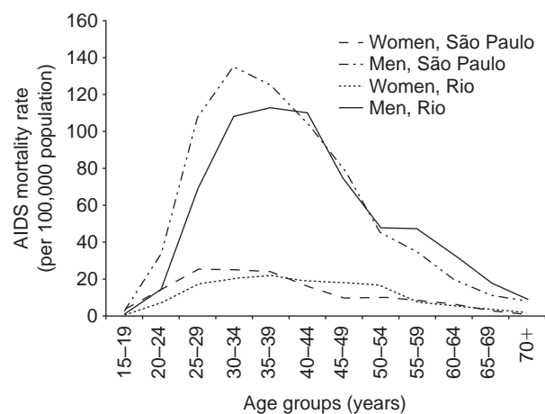
Fig. 2. AIDS mortality rates (per 100 000 population) in men and women per 5-year age group, São Paulo and Rio de Janeiro, 1994. [Source: Ministry of Health (SIM: DATASUS) and Institute of Geography and Statistics (FIBGE), Brazil.]

Figure 2 shows 1994 mortality rates from AIDS in adolescent/adult men and women in Rio de Janeiro and São Paulo municipalities, by 5-year age group. A total of 1123 deaths from AIDS in men and 281 in women aged 15 years and older occurred in Rio in 1994; in São Paulo, 2369 AIDS deaths in men and 543 in women were reported. AIDS mortality rates peaked at 30–34 years in men and 25–29 years in women in São Paulo; in contrast, the highest rates in Rio occurred in the 35–39 years age group in both men and