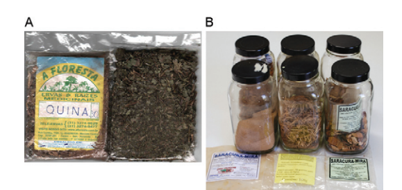
Fig. 1: medicinal plants sold by healers in opened markets: A: a dried sample of a cinchone-like plant (quina) acquired in city markets; B: Ampelozizyphus amazonicus (Rhamnaceae) in the form of dried roots sold in the Amazon markets under the names of "Indian beer" or Saracura-mirá and largely used against malaria as a cold infusion in some malaria regions; although the plant extract of this species was inactive against malaria blood stages, in several experimental models, including against Plasmodium falciparum in vitro, it blocks the sporozoites development in vivo and in vitro, as shown in Fig. 2.

The ART hybrid, 1,2,4,5-tetraoxane (RKA 182), is considered to be an outstanding antimalarial candidate with the advantages of enhanced stability, lower toxicity and improved biopharmaceutical properties (ADME)