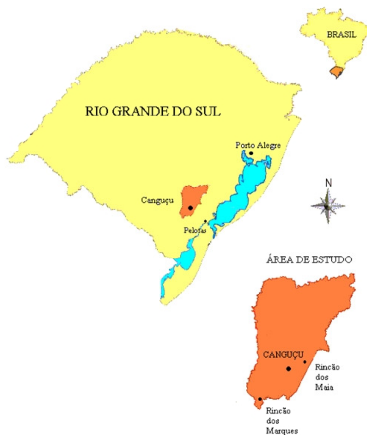
Canguçu municipality, RS – Brazil and Rincão dos Maia community.

with a population of 814 people and 241 families. The typology of life conditions identified three layers: lower with 100 families, middle with 103 and upper with 38 families. The defining variables were in relation to housing conditions, presence of bathrooms and destination of effluents.