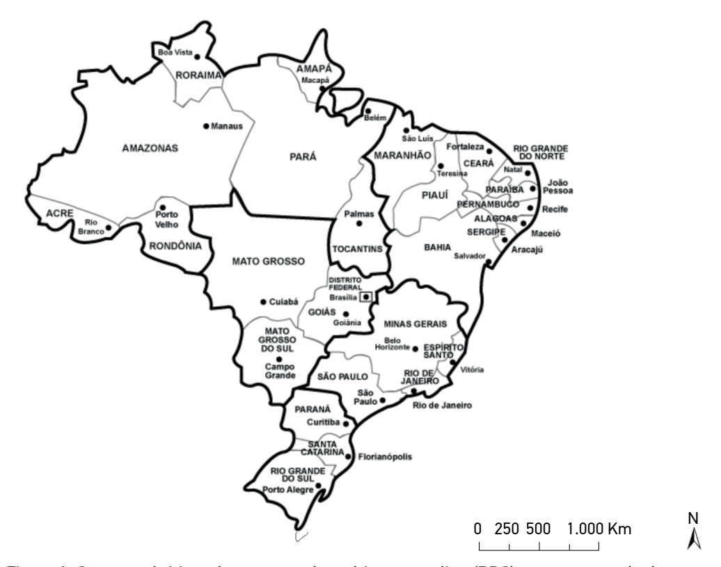
Figure 1. States and cities where respondent-driven sampling (RDS) among men who have sex with men (MSM) was conducted in 2016, Brazil.

Before initiation of the BBSS we conducted formative research (FR) as recommended<sup>28</sup> using both individual interviews and Focus Group Discussions (FGD)<sup>29</sup>. The individual and FGD interview guides covered sexual identities, social and geographic organization of MSM in each city and perceived community acceptance, including violence, homophobia and stigma. Questions related to study logistics such as the site of the study, hours