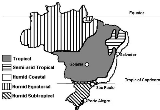
Figure 1. Location and climate of cities in Brazil where samples were collected.

Specimen collection. Stool specimens were obtained from August 2005 through August 2006 from children <5 years of age who had acute diarrhea and lived in 4 different cities in 4 distinct regions in Brazil (Figure 1): Goiânia (Goiás State, Midwest region; ~1.2 million inhabitants), Porto Alegre (Rio Grande do Sul State, South region; ~1.4 million inhabitants), Salvador (Bahia State, Northeast region; ~2.9 million inhabitants), and São Paulo (São Paulo State, Southeast region; ~10.9 million inhabitants). Stool samples were collected from hospitalized children with acute gastroenteritis and/or from children who required rehydration therapy equivalent to WHO plan B (oral rehydration therapy) or plan C (intravenous re-